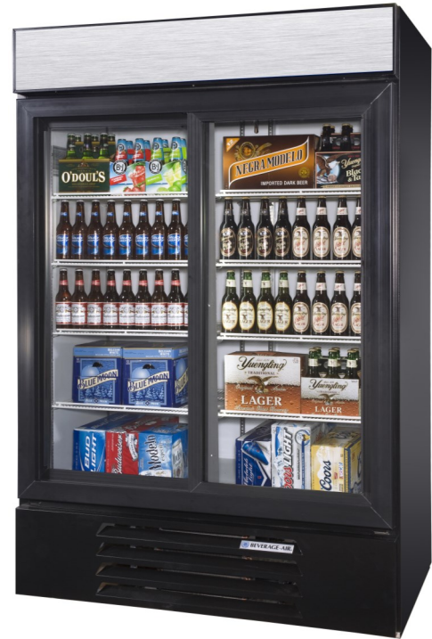
LV45-1-B (shown with 4 shelves per section)

Units wired at factory and ready for connection to a 115/60/1